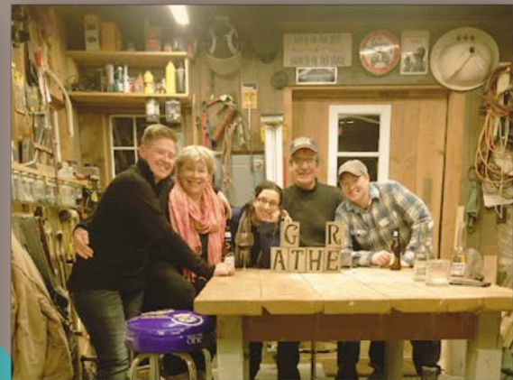
Hanging out in the "wood shop" at the Vermont house