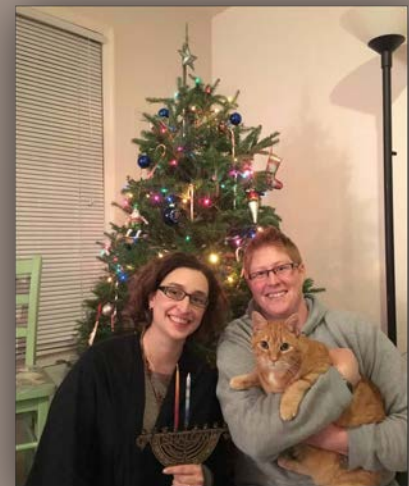
Celebrating Hannukah and Christmas

We love the outdoors and history. We enjoy traveling, weekend getaways to small historic towns, state and national parks.