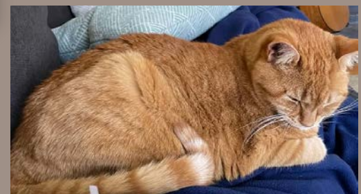
Zahav (means gold in Hebrew) is our 13 year old tabby cat