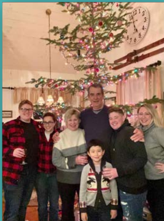
Christmas in Vermont!