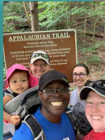
Hiking with twin sis and fam!