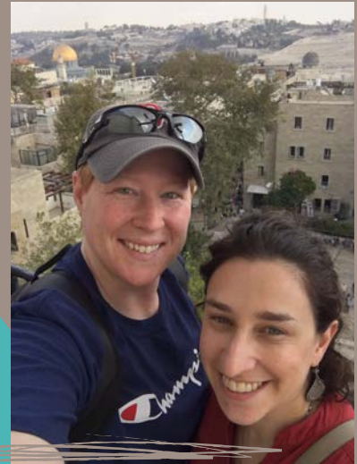
On a trip to Jerusalem!

We love the outdoors and history. We enjoy traveling, weekend getaways to small historic towns, state and national parks.